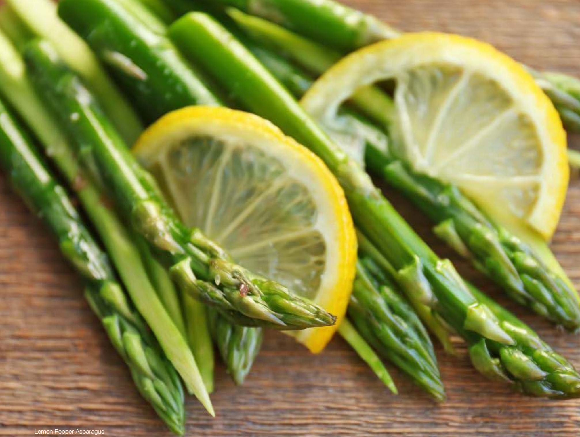
Lemon Pepper Asparagus