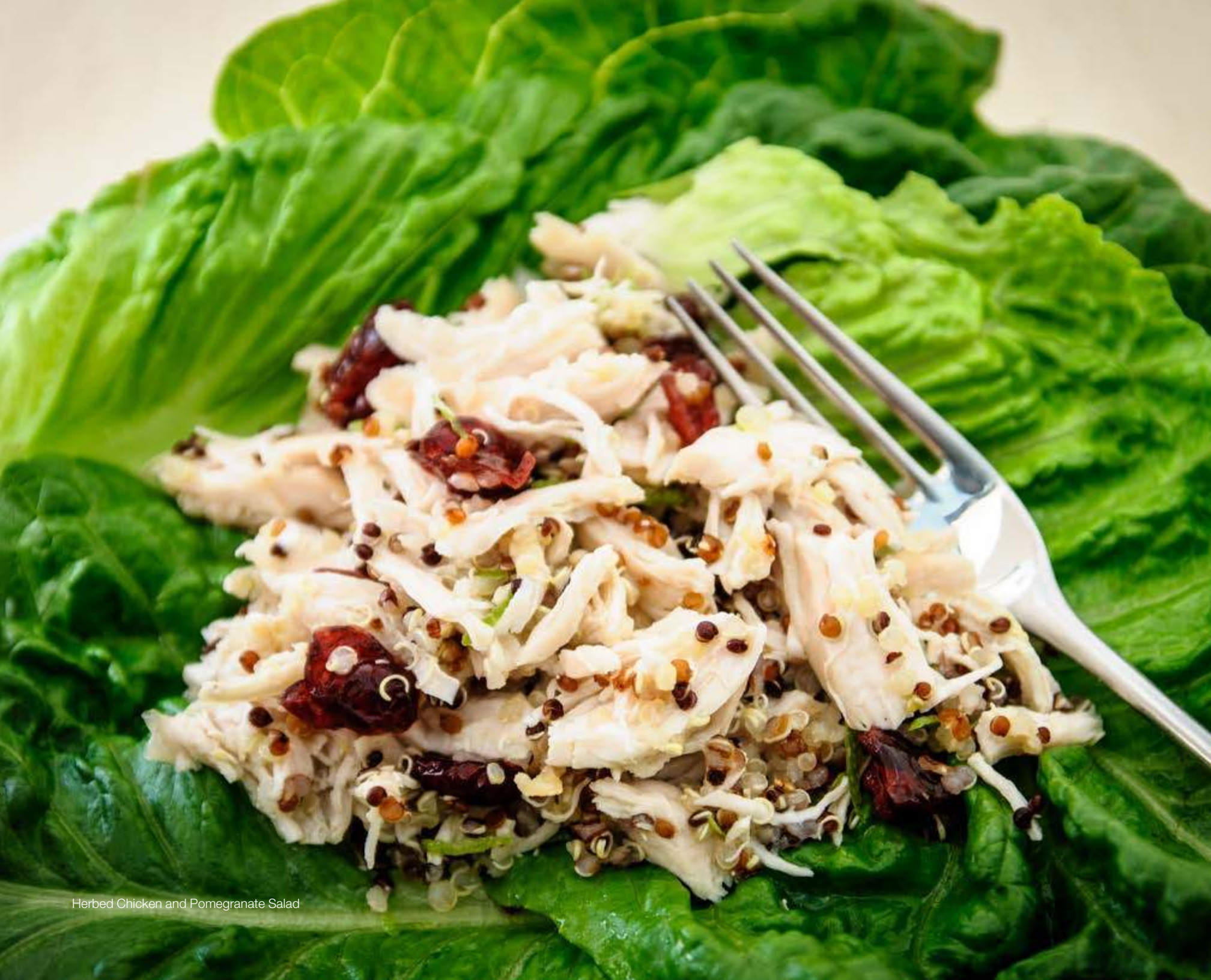
Herbed Chicken and Pomegranate Salad