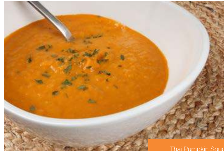
Thai Pumpkin Soup

Sauté onion in olive oil until soft. Add tomato paste, pumpkin, ginger, garlic, and broth. Combine until thoroughly heated and place in blender. Add chilies, coconut cream, coconut milk, and lemon juice. Blend for 30 seconds. Season with sea salt and pepper to taste. Serve immediately. Note: If a less sweet soup is desired, omit coconut cream and increase coconut milk to 1½ cups. Serves 2-4.