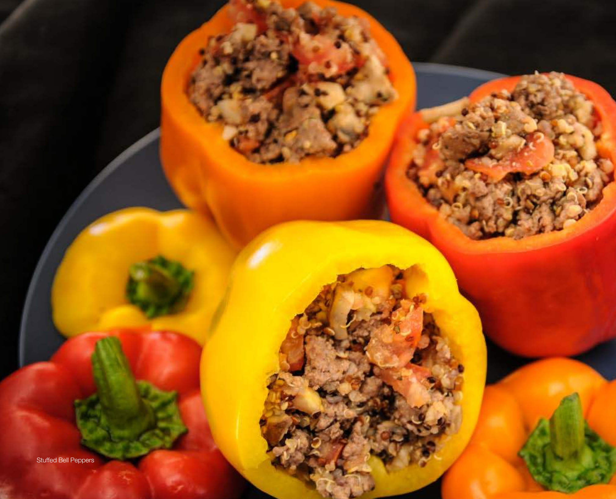
Stuffed Bell Peppers