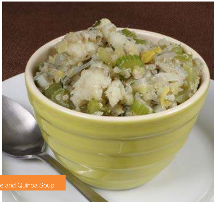
Vegetable and Quinoa Soup

Preheat oven to 350 F. Rub potatoes with 1 tablespoon olive oil and place on baking sheet. Wrap a head of garlic in aluminum foil and place on baking sheet with potatoes. Bake for 30 minutes or until potatoes are soft. Heat remaining oil in a medium sauté pan with the onion until onion is translucent, about 3 minutes. In a blender or food processor, add onion, garlic, and about half of the potatoes. Purée mix thoroughly. Transfer to a large soup pan and add all remaining ingredients. Heat to a boil, then lower heat and allow to simmer for about 15 minutes. Serves 4.