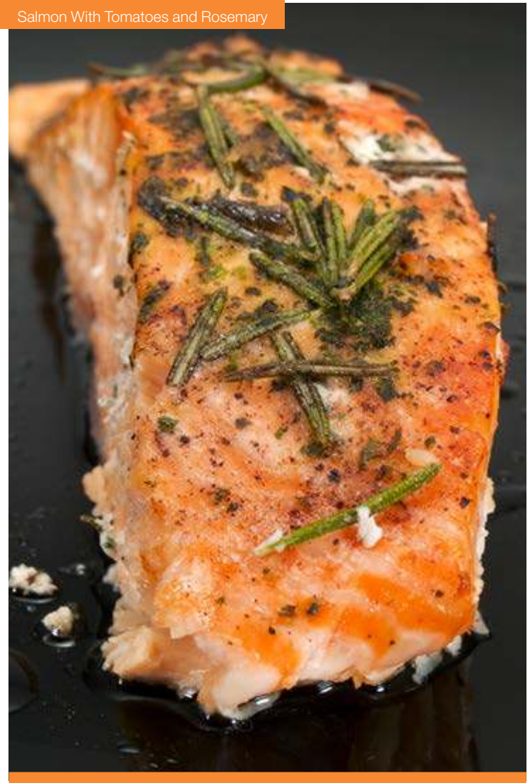
Salmon With Tomatoes and Rosemary

In a medium sauté pan, heat oil at medium-high heat. In a small bowl, combine the spices. Turn the salmon fillets in the spices, covering all sides. Place the salmon fillets (skin side under) in pan. Cook for 3-5 minutes before turning over. Cook another 3-4 minutes or until done. Serves 2.