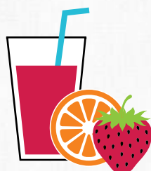
Shake 3 per day